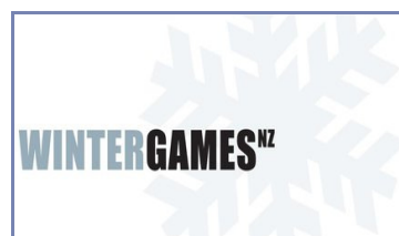
Winter Games NZ Logo

it in. A great chance to see some up and coming talent from around Oceania.