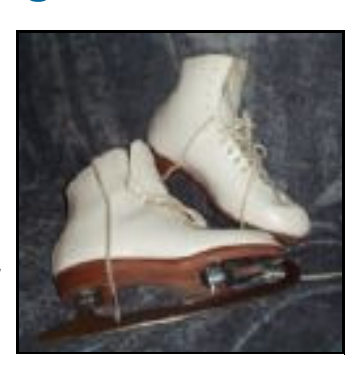
National Council wishes every one a great skating year for 2009

We wish everyone a great year of skating and hope that you all achieve your goals.