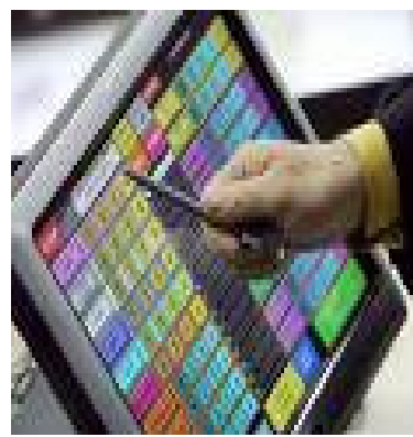
A judge at work

up, we have a number of queries about probationary judging, particularly from young skaters who may be wishing to start their judging activities. Section 3 of the Officials' Train-