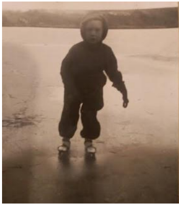
Going solo on double runner blades - about 2 years of age